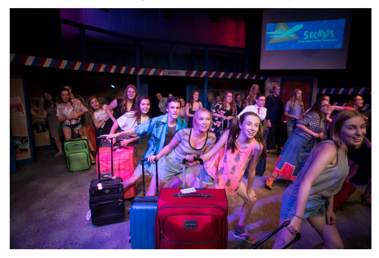
Secrets Every Smart Traveller Should Know