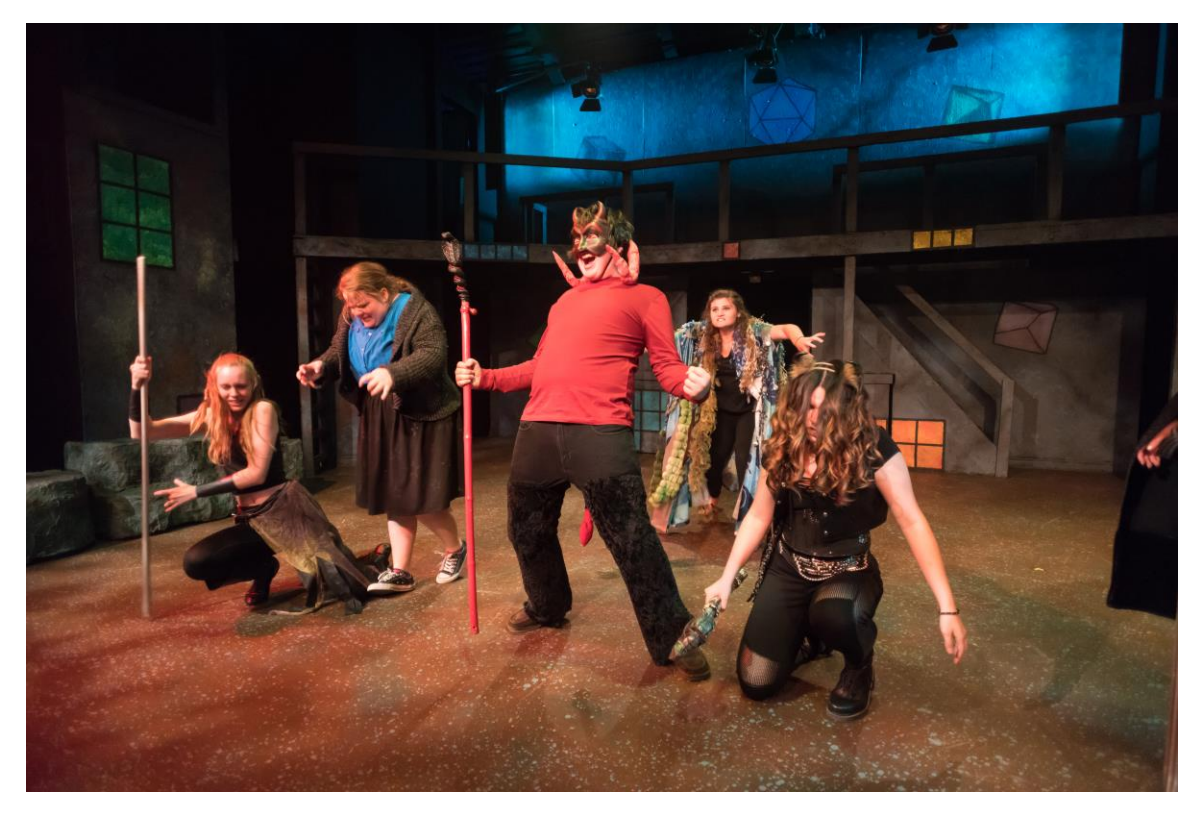
She Kills Monsters: Young Adventurers' Edition