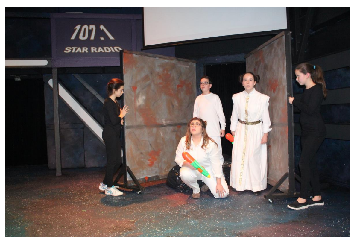
Star Chores: The Phantom Maintenance