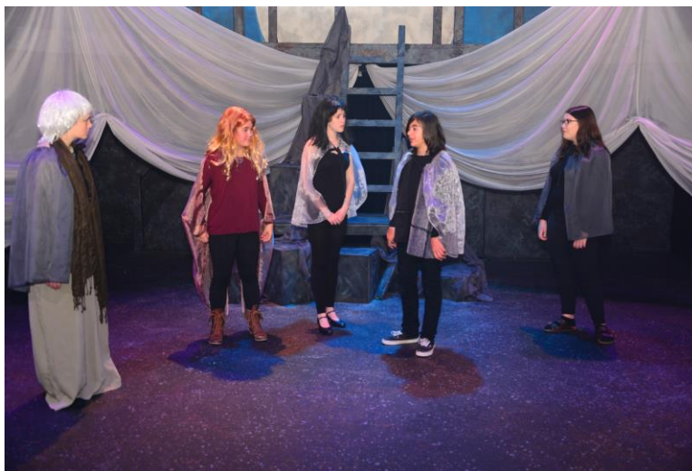
Silverwing

I think I say this every month, but it's hard to believe that this Fall season is flying by so quickly! We have already opened two very successful productions for our 26 th season, Silverwing and The Seussification of Romeo & Juliet . And November is shaping up to be a very busy month indeed! Read on for more!