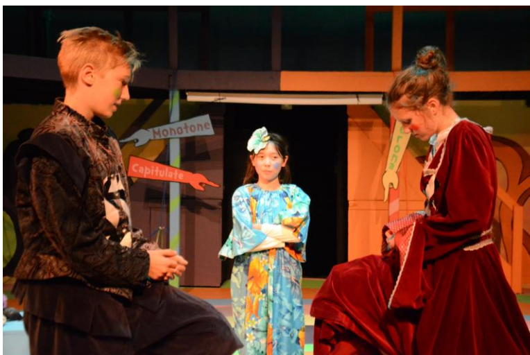
The Seussification of Romeo & Juliet