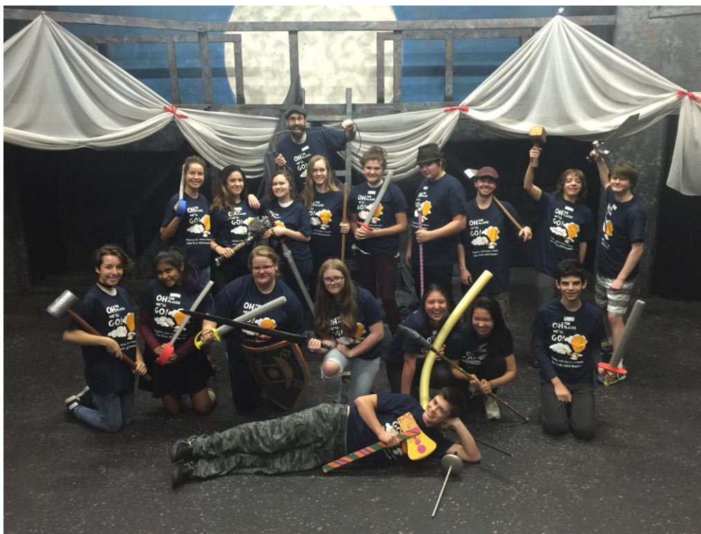
The cast of She Kills Monsters with their weapons!

We continue on our month of epic geekery and go from video games and sci-fi to the world of fantasy role-playing games! She Kills Monsters , playing November 18-20, tells the story of Agnes Evans as she leaves her childhood home in Ohio following the death of her teenage sister, Tilly. When Agnes finds Tilly's Dungeons & Dragons notebook, however, she stumbles into a journey of discovery and action-packed adventure in the imaginary world that was Tilly's refuge. This dramatic comedy is filled with homicidal fairies, nasty ogres, epic battles, and 90s pop culture – a heart-pounding homage to the geek and warrior within us all.