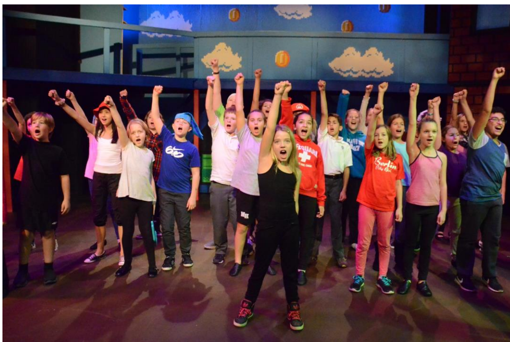
The cast of Press Start! with Stagecraft: The Video Game

We start with Stagecraft: The Video Game , where Katie strikes a deal with her cousin Matt: he has to be in her school play unless he can beat the new, never-before-seen video game she's brought along with her. Matt soon finds himself in a wild, virtual world of theatre! And Press Start! is a new musical unlike anything else: it's the first show ever to be composed entirely in 8-bit synthesizers reminiscent of the soundtracks from the original Nintendo and Sega consoles. When the famous characters we know and love run out of lives, they decide to put on a musical fundraiser that will help them raise gold rings to play on. Through hilarious and heartfelt musical numbers we see the heroes, villains and sidekicks like we've never seen them before.